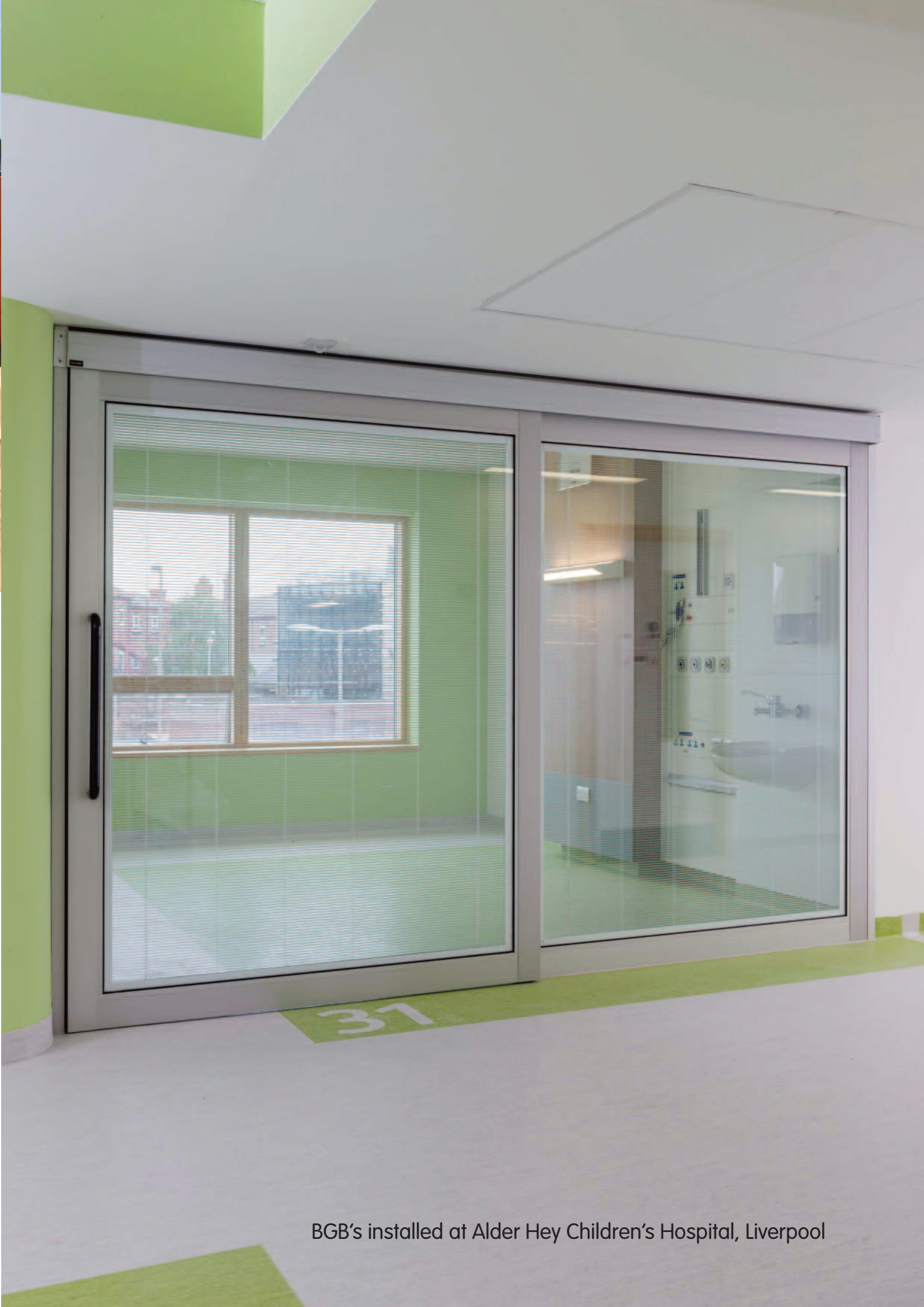
BGB's installed at Alder Hey Children's Hospital, Liverpool