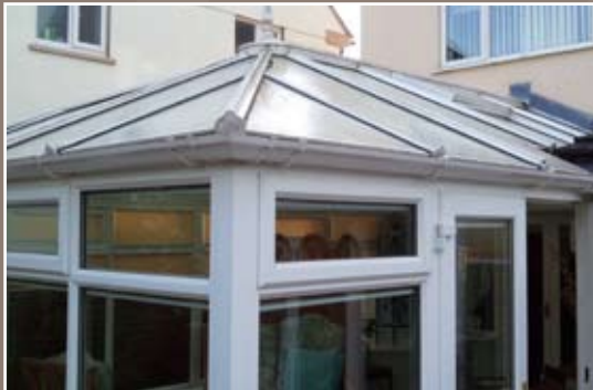
Tired conservatory roof