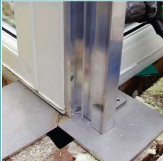
Retro-fix posts support new glass roof