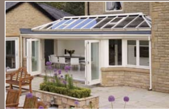
Orangery & Bespoke

The designs shown above form the vast majority of the conservatory market, but there is the option to integrate products such as Pilaster and Cornice into the final installation, as shown later in this brochure. You can in some instances and depending on the type of replacement you are looking for, consider a completely new or even more radical design.