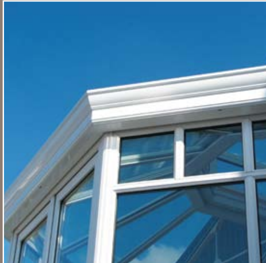
Modern Cornice system