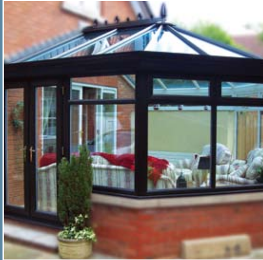
2. Roof, windows and doors