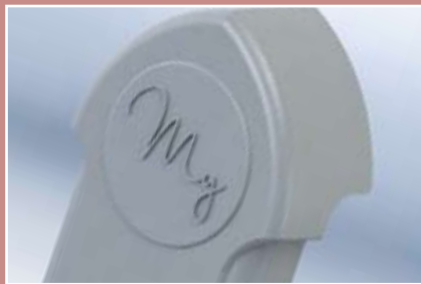
Subtly branded cappings

With a nationwide network of experienced Registered Installers and our unique product range, we believe that no other company can match these credentials. We're also part of Prefix Systems, the UK's largest and most established manufacturer of conservatory roofs and we've been involved in over 50,000 conservatory projects in our last 15 years, including some very prestigious commercial projects. Above all, we're the UK's leading specialist in replacement conservatories