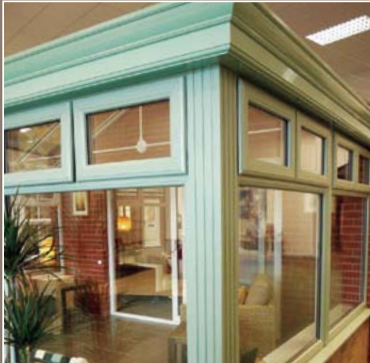
Decorative Pilaster corner posts