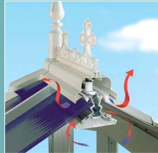
Controlled ventilation reduces condensation

We've harnessed our expertise in the conservatory market and designed a number of specialist, structural products for replacement conservatories. We also use the Ultraframe conservatory roof, as they are a world leader in their field, with several patents and unique design features. Controlled ventilation is as important in a conservatory as it is in a house, helping reduce condensation and that's why we've incorporated it into the conservatory roof as a free upgraded feature.