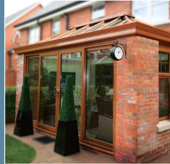
3. Complete conservatory

There are 3 distinct options for replacing your conservatory depending upon your aspirations, budget and location. The first option is to simply replace your existing roof with a new generation one and we would highly recommend the use of Ambience high performance roof glass. Conservatory roofs are generally harder to maintain, are more prone to the elements and more likely to deteriorate first.