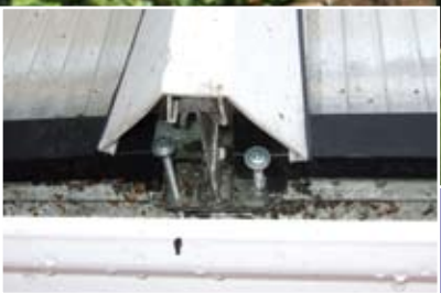
Unsecured glazing bar