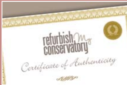
Certificate of authenticity