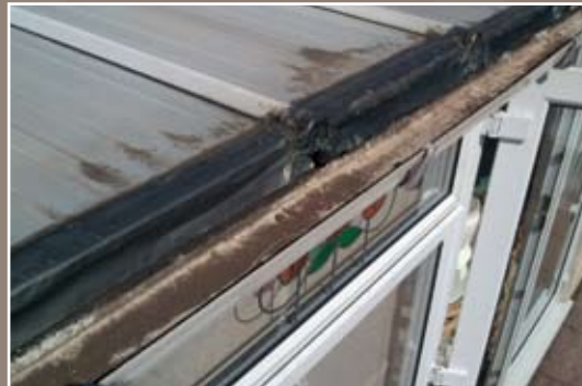
Poorly installed products