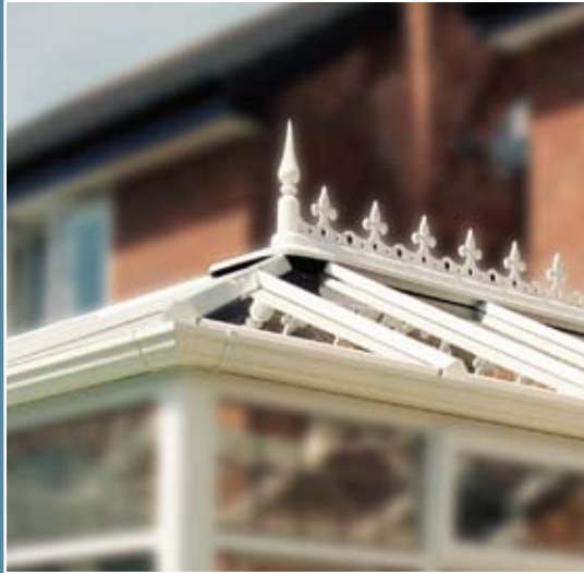
1. Roof only