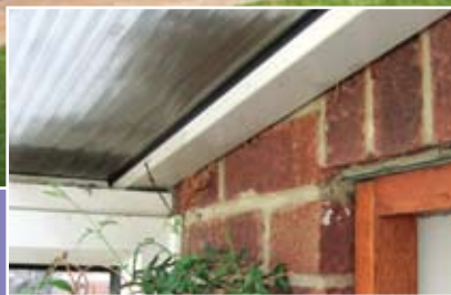
Discoloured polycarbonate roof

When you replace your tired conservatory, you have an opportunity to create something more individual as this family did. In this project, a tired white Victorian conservatory was replaced with something a little more impressive. This golden oak conservatory is based upon an Orangery design with the use of our Cornice product on the conservatory roof and the brickwork was extended upwards in the two facing corners.