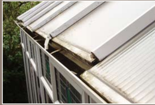
Slipped polycarbonate causes leaks