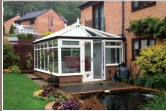
Georgian & Edwardian