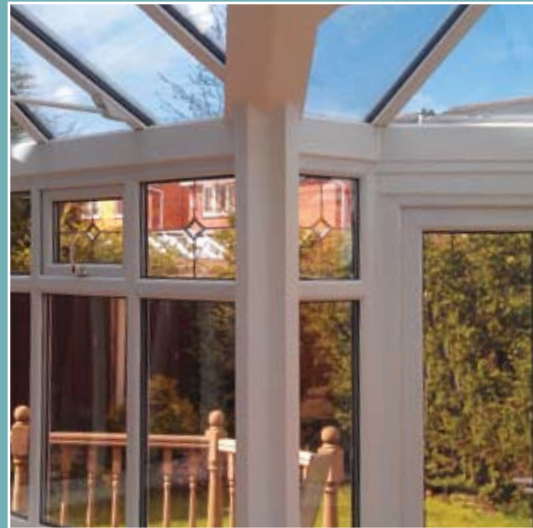
Installed Retro-fix posts