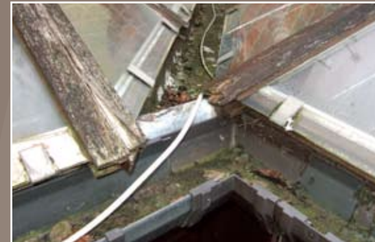
Rotting timber conservatory

The pictures above are just some of the hundreds of images we have of failed conservatories. Some of these installations leak, are draughty and just look unsightly. Missing end caps, broken guttering and poor seals are fairly general problems on roofs, while conservatories glazed in polycarbonate may look steamed up, dirty and may even contain dead insects. Other areas of plastic may have discoloured from the sun, while timber roofs may show signs of rotting away. All these issues also contribute to significant heat loss.