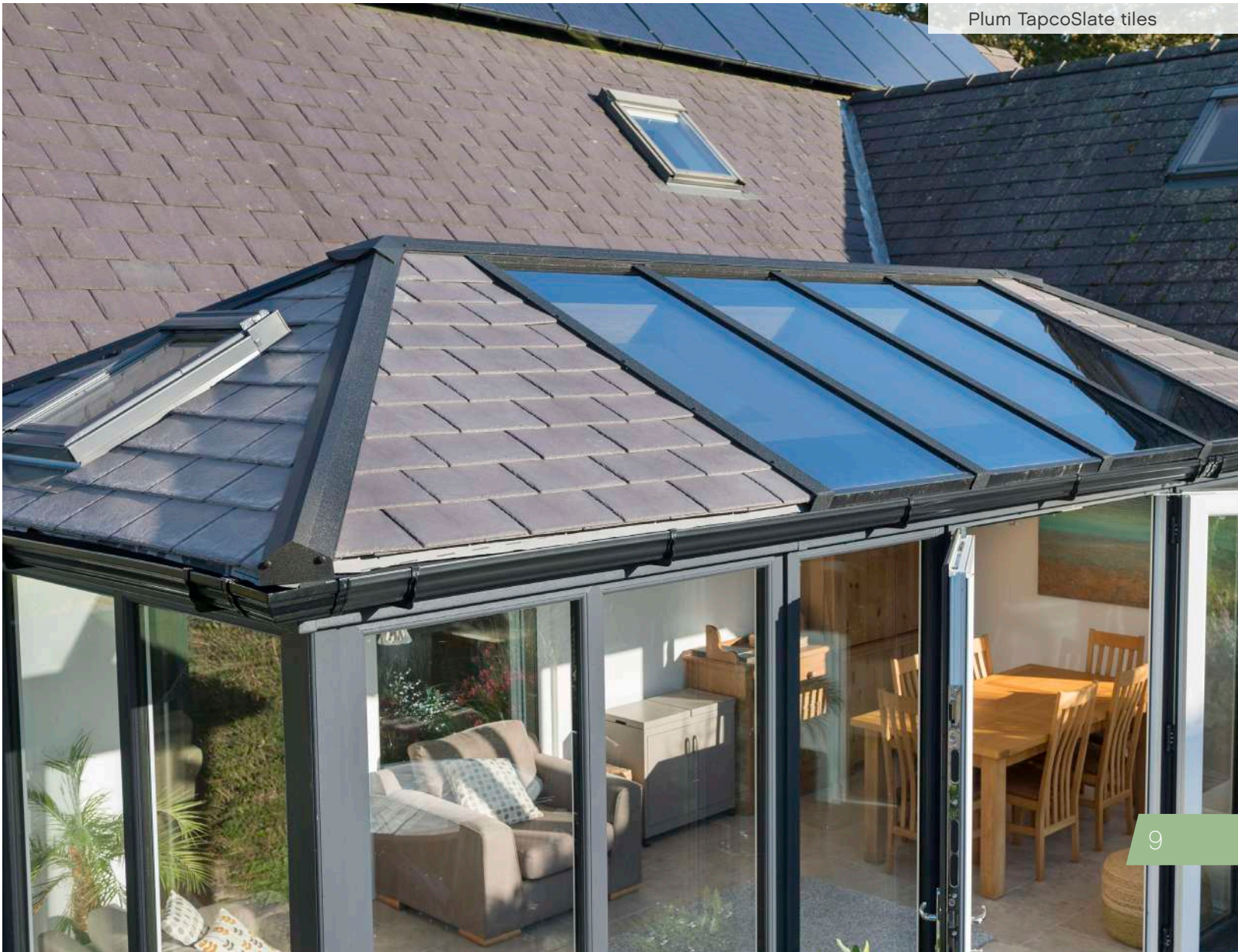
Plum TapcoSlate tiles