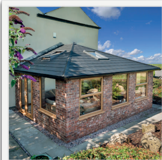
GEORGIAN or EDWARDIAN

The WARMroof is designed to accommodate all existing conservatory roof styles as these are more complex than typical traditional extension roofs. Therefore, to date, we haven't had a roof design that is beyond the scope of the roof's capabilities. No matter what shape or style of conservatory you have, there is a WARMroof for you. Below are some examples of WARMroof installations on various styles of conservatory or home extension.