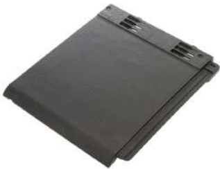
Slate Grey ▲