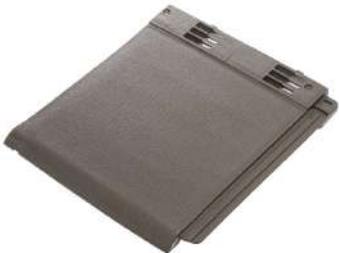
Dark Brown ▲