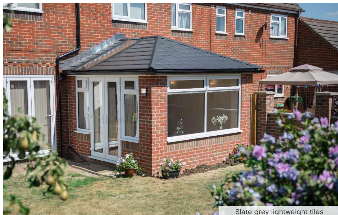
Slate grey lightweight tiles