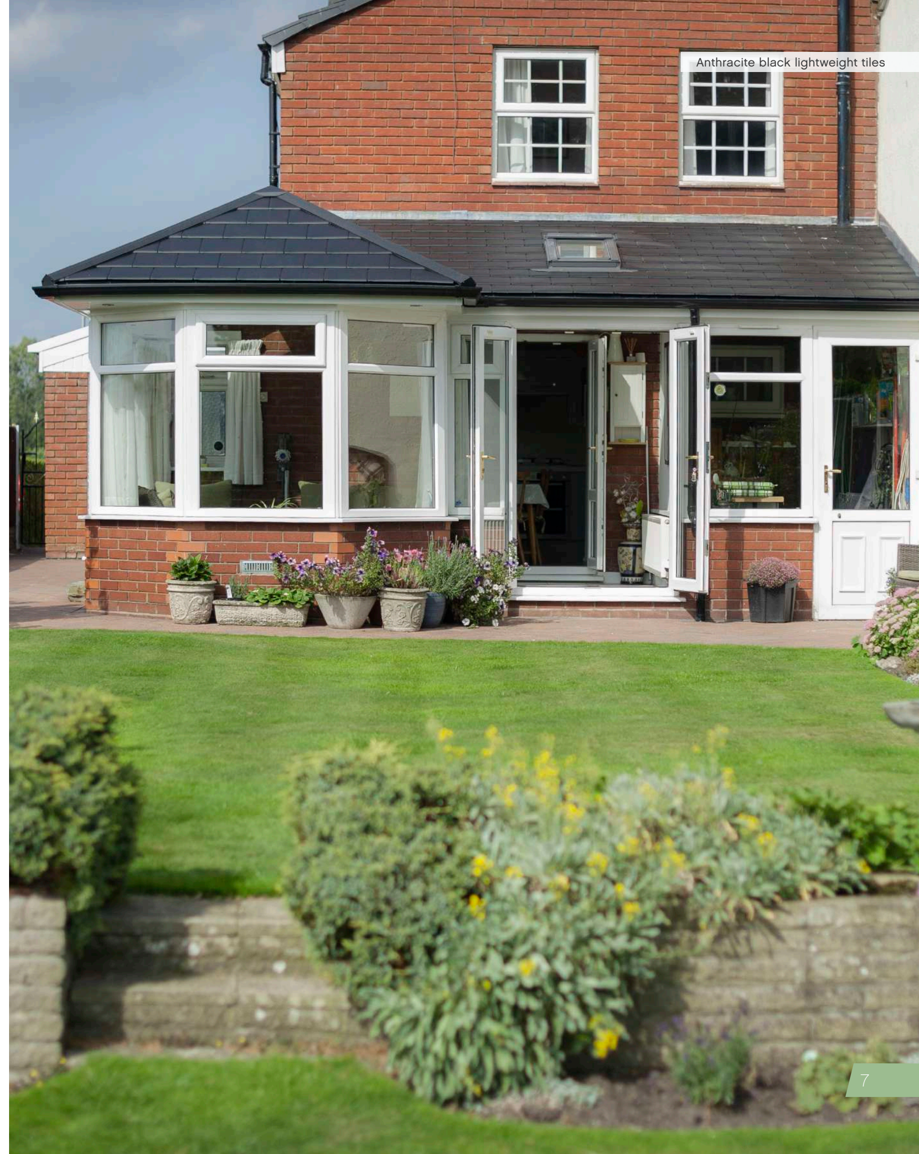
Anthracite black lightweight tiles

Whether it's a new addition to your home or part of a conservatory refurbishment, the WARMroof is designed to incorporate the features of the main house in terms of brickwork, roof tile colour and even roofing pitch, much like a traditional extension. The choice of two stock tiles including a slate effect tile come with either a 25 or 40 year warranty giving you complete peace of mind. WARMroof is also structurally proven to accommodate traditional slate or concrete tiles to match your home. You may also want to consider the latest bi-folding doors and Velux roof-lights into the overall design, for added flexibility.