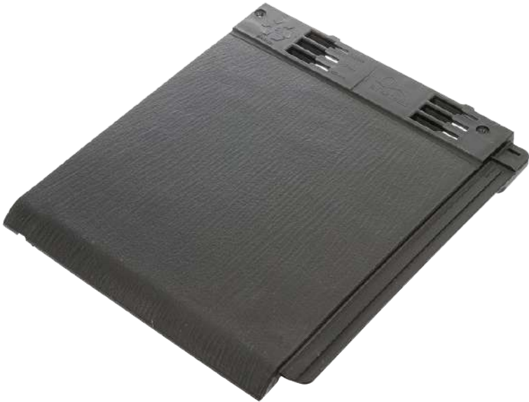
Anthracite Black ▲

This lightweight tile is the most popular choice of tile for the WARMroof due to its excellent green credentials. This flat, precision manufactured, recycled polymer, lightweight roof tile is available in a choice of 4 colours with a 25 year warranty. If you would like to see a sample of this lightweight tile in your desired colour choice, please contact us to request a free sample.